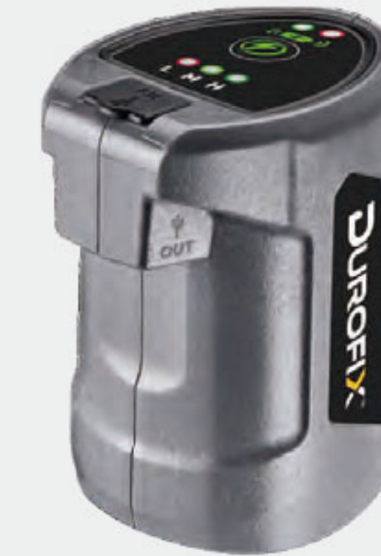
Battery pack not included