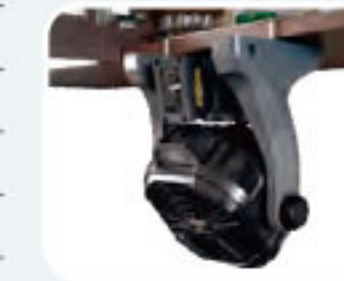
SPRING LOADED CLAMP